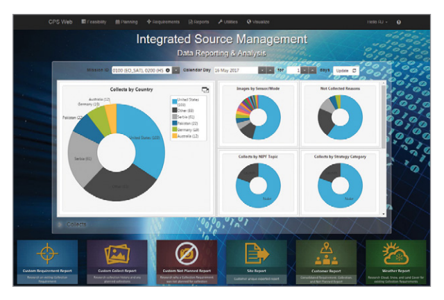
Custom Reports, Statistics, and Analytics